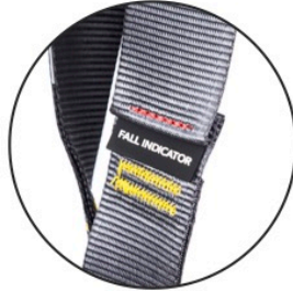
Rip stitch indicators