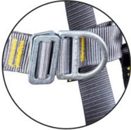
Front attachment point