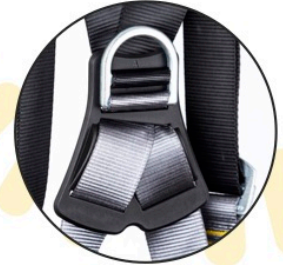
Rear attachment point

Visit our full safety equipment section at www.warrenaccess.co.uk/safety-equipment