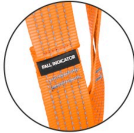
Rip stitch indicators