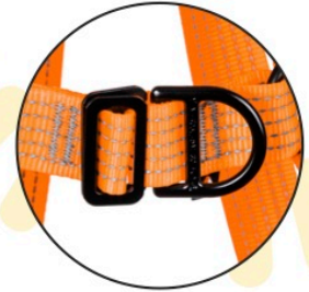
Front attachment point