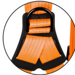
Rear attachment point

Visit our full safety equipment section at www.warrenaccess.co.uk/safety-equipment